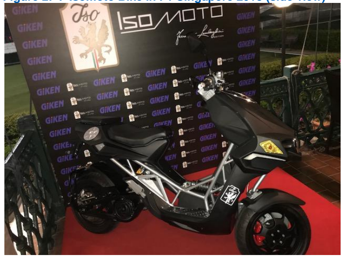
Figure 2: : Isomoto Bike in F1 Singapore 2018 (side view)