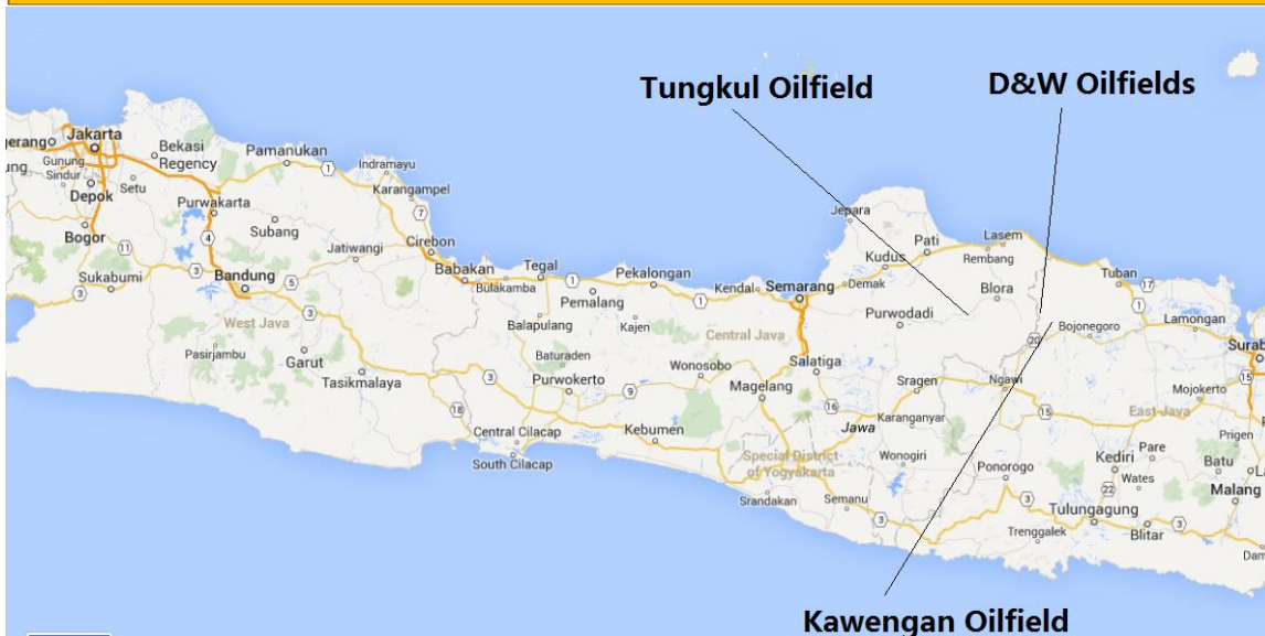
Figure 3: Location of the Oilfields